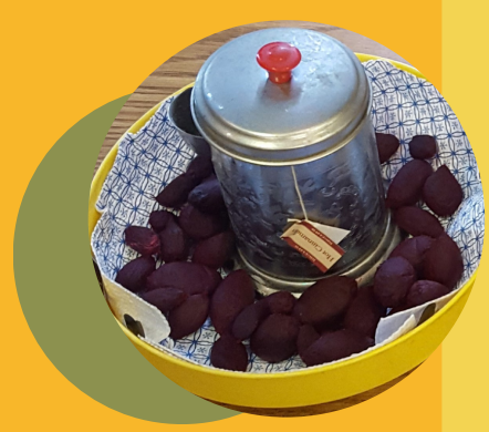
Brew-Tea and the Beets