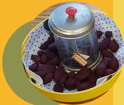
Brew-Tea and the Beets

Join Waukesha's celebration of books, art, food, and culture. Participants create an "edible book," which can be inspired by a favorite tale, involve a pun on a famous title, or simply be in the shape of a book.